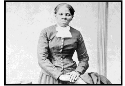
Ms. Harriet Tubman

1974– Lee Elder becomes the first Black professional golfer to qualify for the Masters Tournament.