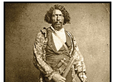
Mr. James Beckwourth

1803– Haitian Liberator, Toussaint L’Ouverture died.