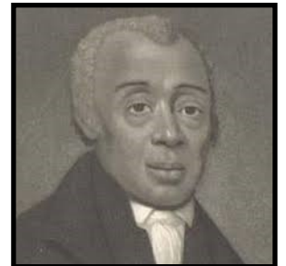
Bishop Richard Allen

1899-- Chemist Percy Julian, whose research helped create treatment for arthritis was born in Montgomery, Alabama.