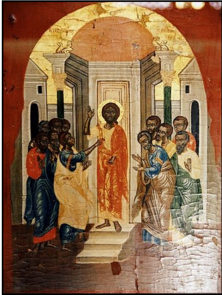
Earliest known image of Jesus Christ, from the Coptic Museum in Cairo, Egypt